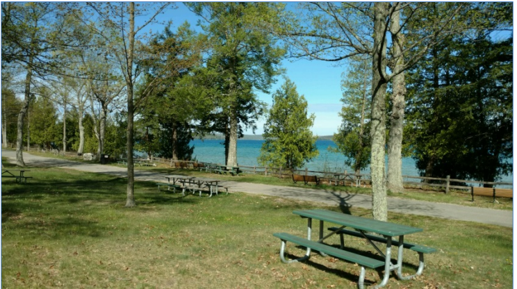
OLD SETTLERS PARK, BURDICKVILLE

For maps and information, stop in at the Philip A. Hart Visitor Center located at the eastern edge of the Village of Empire (M-72 off M-22) or call 231-326-4700, ext. 5011.